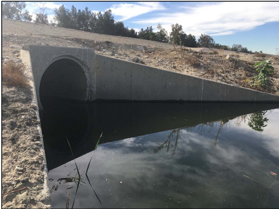
Wineville – Existing Basin Outlet