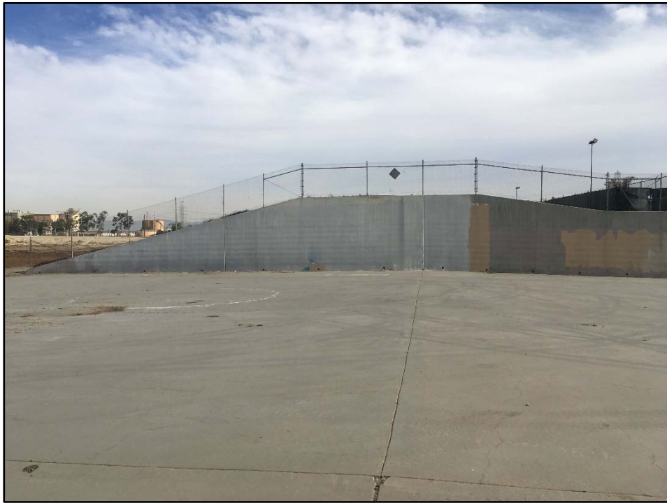
Wineville – Proposed Location of Rubber Dam