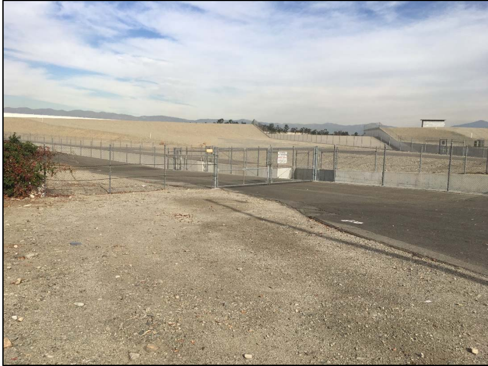
Near Jurupa Path of New 30-Inch Pipeline