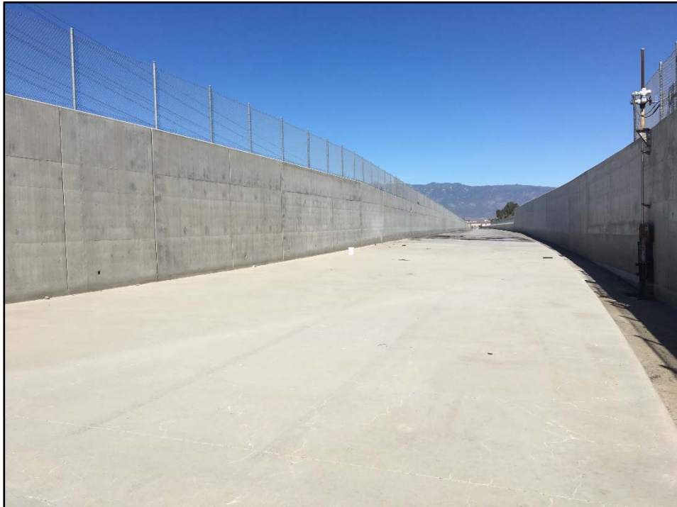
Channel – Proposed Location of Diversion for Jurupa