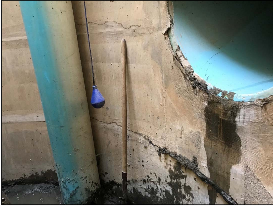
Recent Access into Pump Station Wet Well for Cleaning