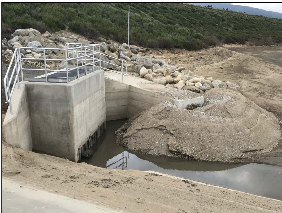
Discovered Alluvial Deposits near the New Stormwater Inlet Structure