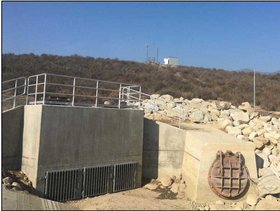
Completed Stormwater Inlet (Pump Station) – Adjacent to Existing Outlet Pipe (right)