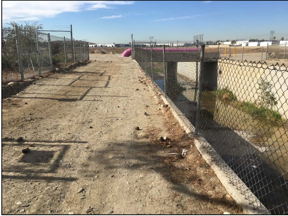
Near Wineville - Path of New 30-Inch Pipeline