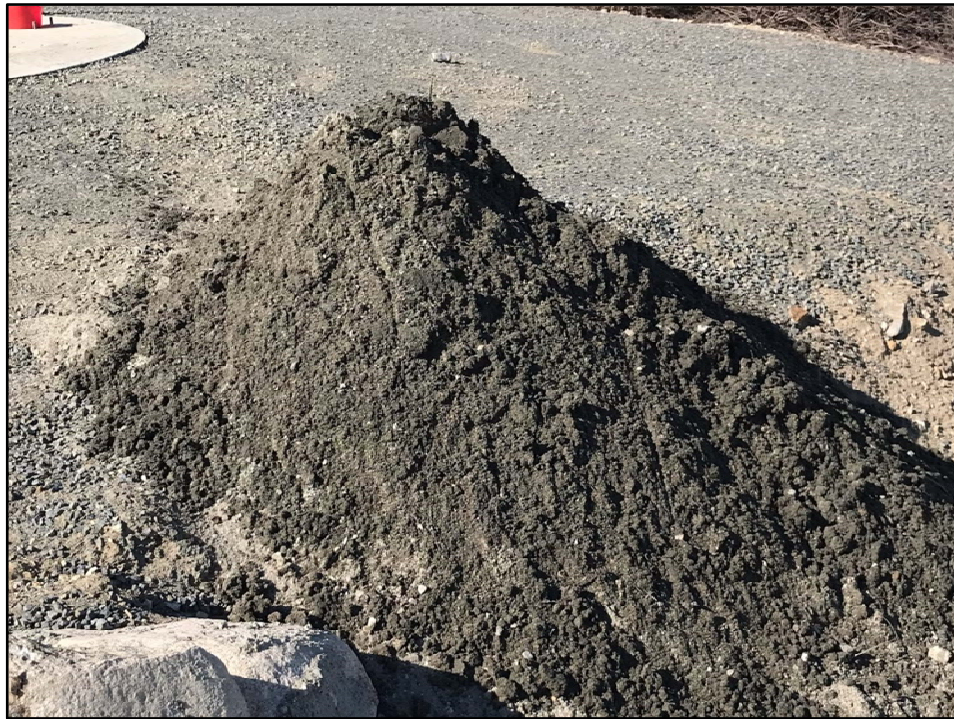
Removed Alluvial Deposits within the Pump Station Wet Well (less than 1 cubic yard)